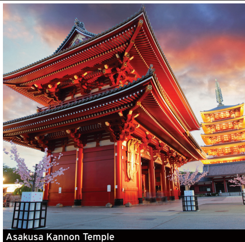
Asakusa Kannon Temple