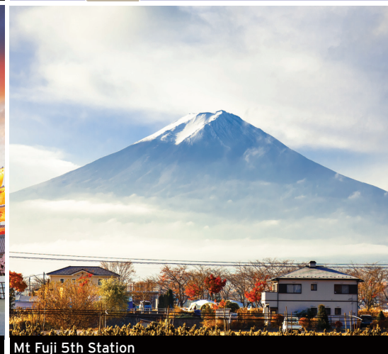
Mt Fuji 5th Station